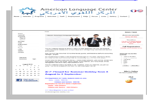
Figure 1: A Website Homepage of the American Language Center Meknes

(The American Language Center, June 2013, http://www.alcmeknes.org, last accessed on June 18, 2013)